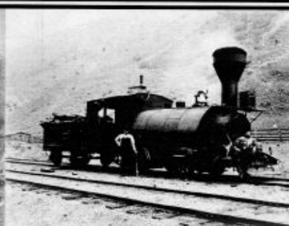
No. 2 Emory