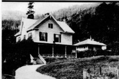
Onderdonk Residence at Yale.

2 hand-made beef patties topped with sautéed onions and homemade beef gravy. Served with choice of soup, salad, fries, tater tots or mashed potatoes. $14 -