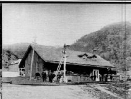
Yale Railway Station