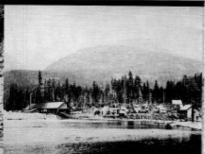
Texas Lake Sawmill

ASK YOUR SERVER ABOUT OUR DAILY SPECIALS AND DESSERT SELECTIONS