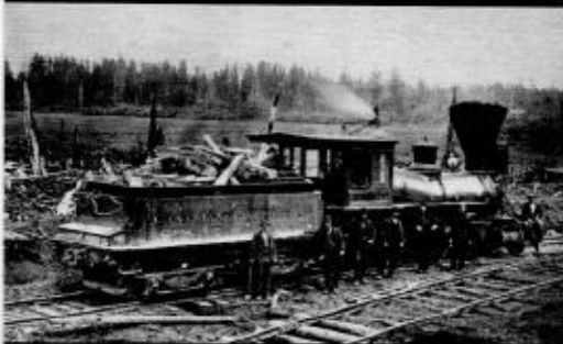
Locomotive #1 "Yale" c.1882

Romaine tossed with creamy garlic Caesar dressing, croutons and parmesan cheese. Served with garlic toast. $12 - Add chicken for $6 -