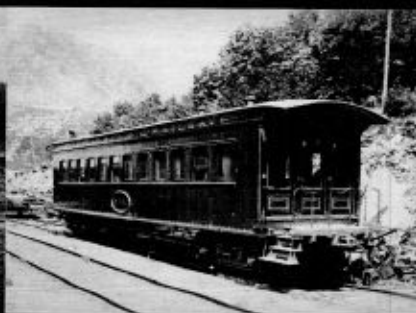
The "EVA". Contractors private car.